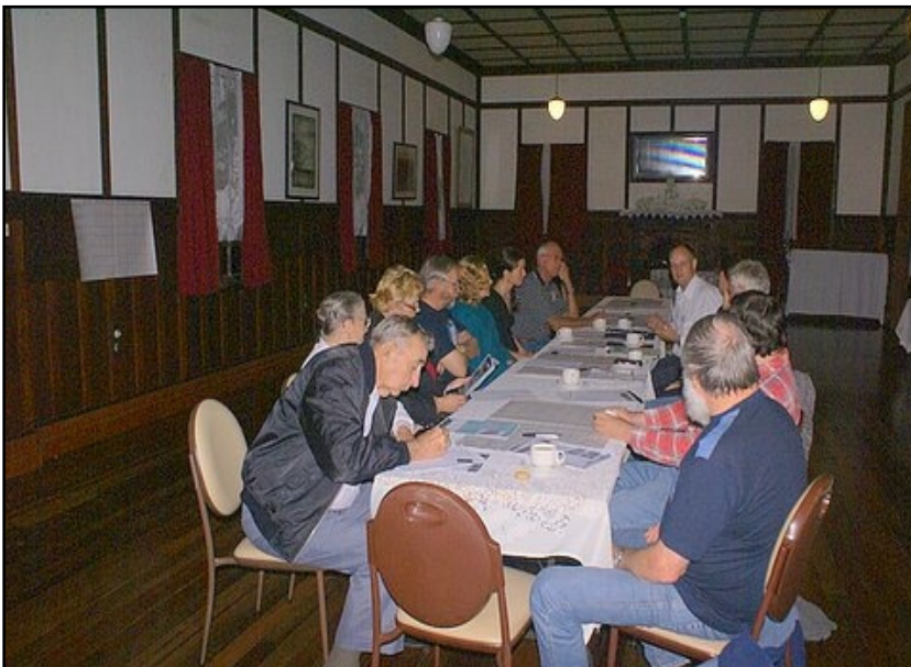
The community meeting held at Malanda Hotel, 7 June 2007

Using a thematic grid to help identify places within each shire proved most effective. Each meeting provided the state-wide survey team with between 10-15 different places for consideration. Although not all of them will appear in our final list of places with state significance for each shire, EPA staff will visit those that meet the criteria for consideration.